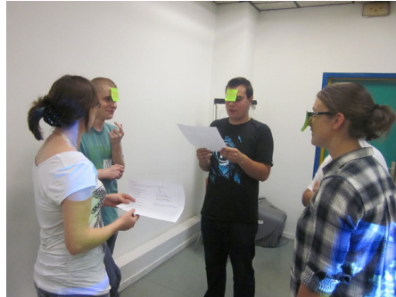
Intercultural Workshop with young people