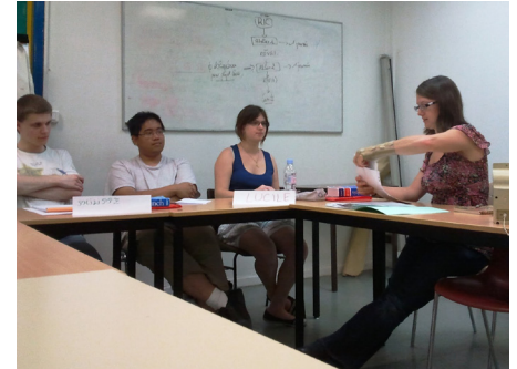
English courses with french young people