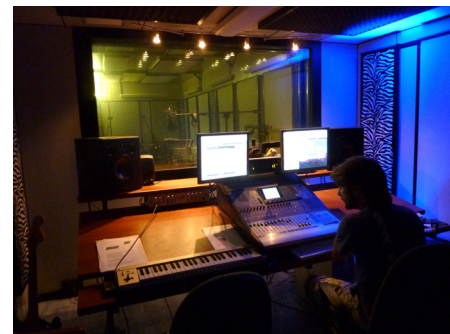
Recording studio in Pesaro