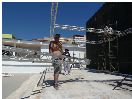
Stage in Lampedusa