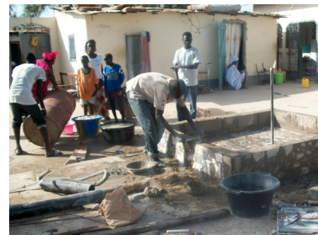
Reparation of an old woman’s house

orphans through social work and play, supporting in a community health initiative delivering sessions on sex, sexuality, Aids & HIV care, protecting the environment & planting trees, working in schools delivering IT sessions and sports coaching in the community.