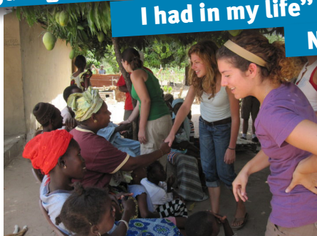
Meeting local family.