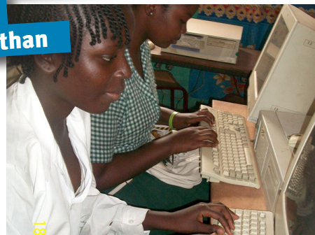
Students on computer class