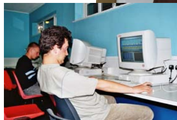
The people in these photos are actors not young people in prison

Number of people we will host: 1 volunteer Length: 12 months